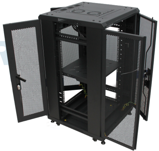
Open Side View

Optional cable entry on top cover and bottom panel. Front door, rear door and side panel can be removed facility, the bottom has the function of ventilation and rat-proof. Varies optional accessories, reliable quality.